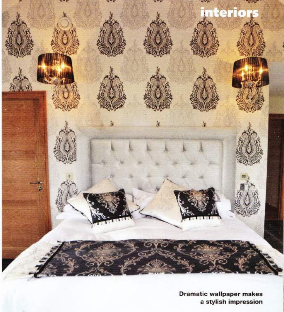
Dramatic wallpaper makes a stylish impression

If the windows have standard glass and you do not want to use a voile Roman blind to give shade, the only