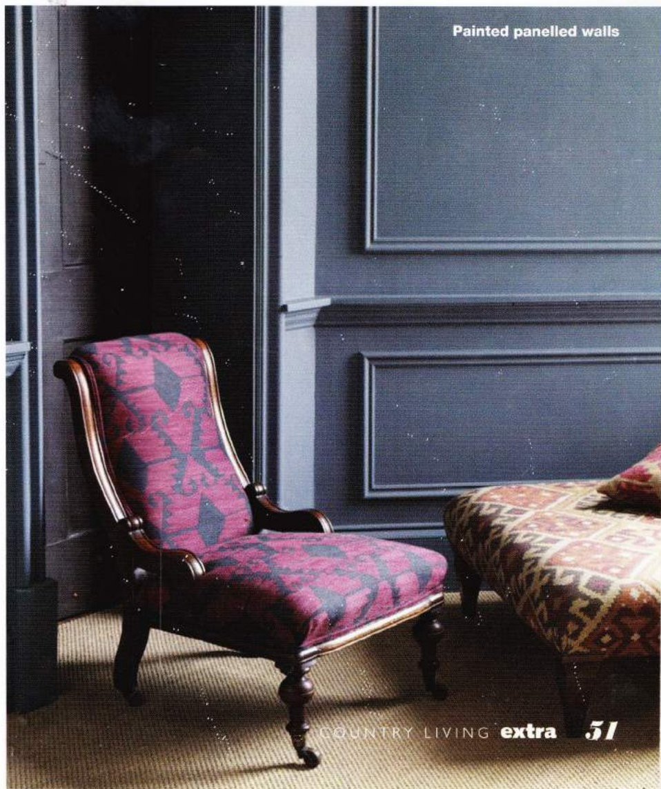
Painted panelled walls