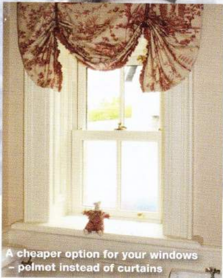
A cheaper option for your windows - pelmet instead of curtains