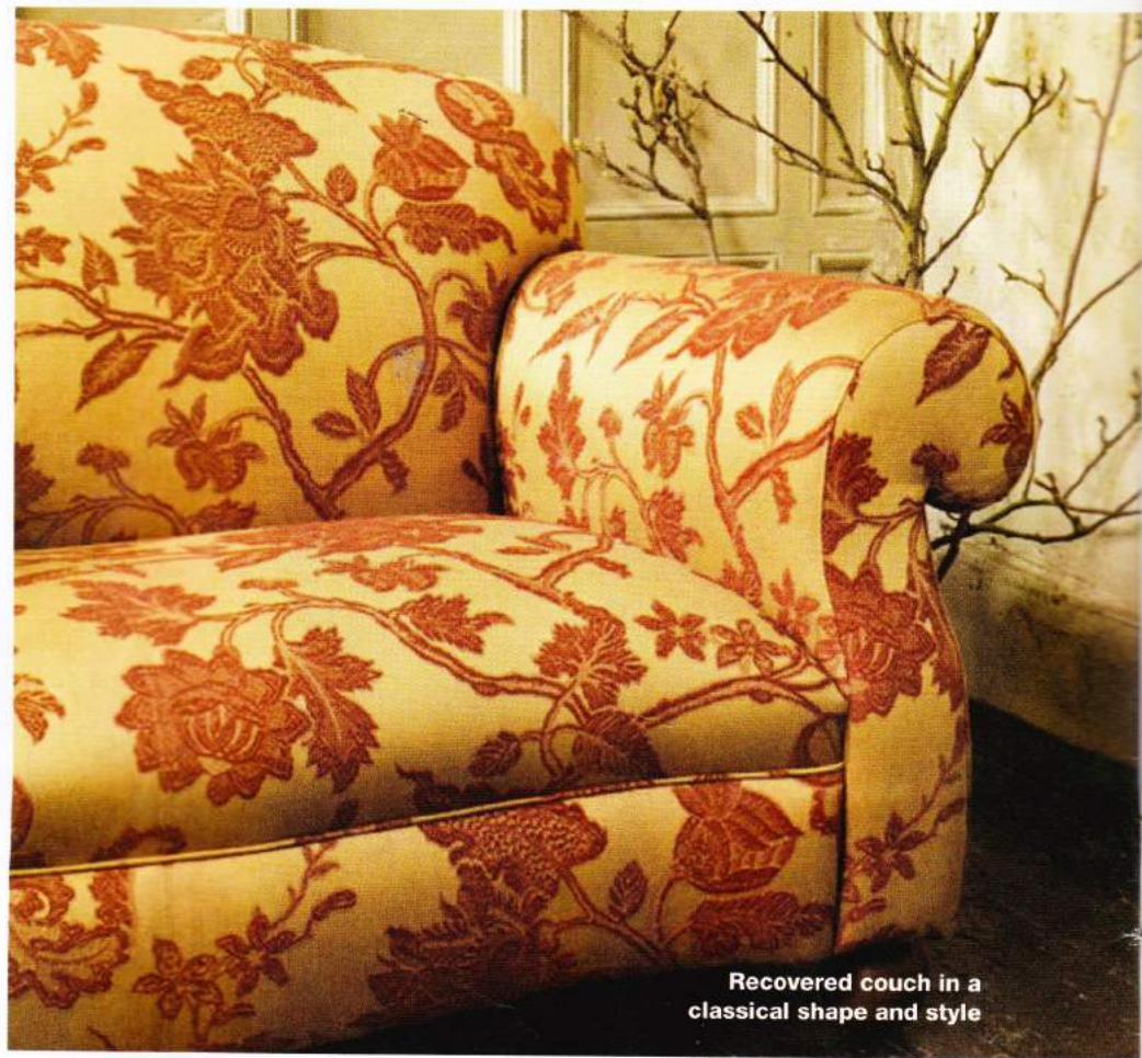
Recovered couch in a classical shape and style

Roman blinds need less fabric so in most cases they will be a cheaper option than curtains. A standard Georgian window is approx 110cm wide by 180cm long. A Roman blind on this window will cost €288 in a plain silk fabric with blackout fleece lining on an easy chain rail, whereas curtains