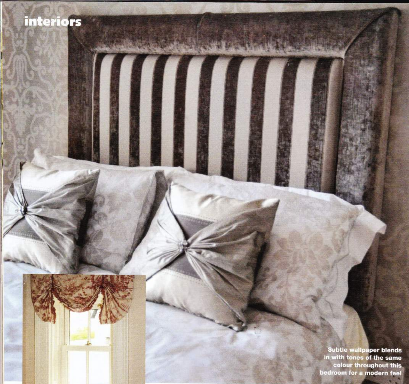
Subtle wallpaper blends in with tones of the same colour throughout this bedroom for a modern feel